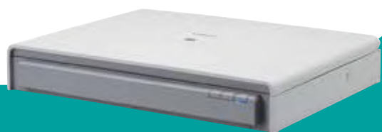
Optional A3 Flatbed Scanner Unit 201